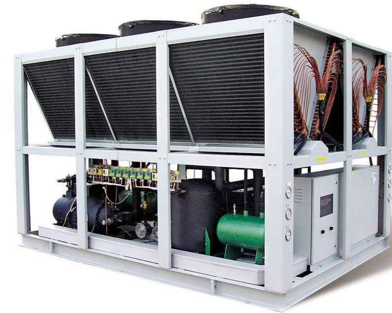
Chiller cooling capacity (250 kW)